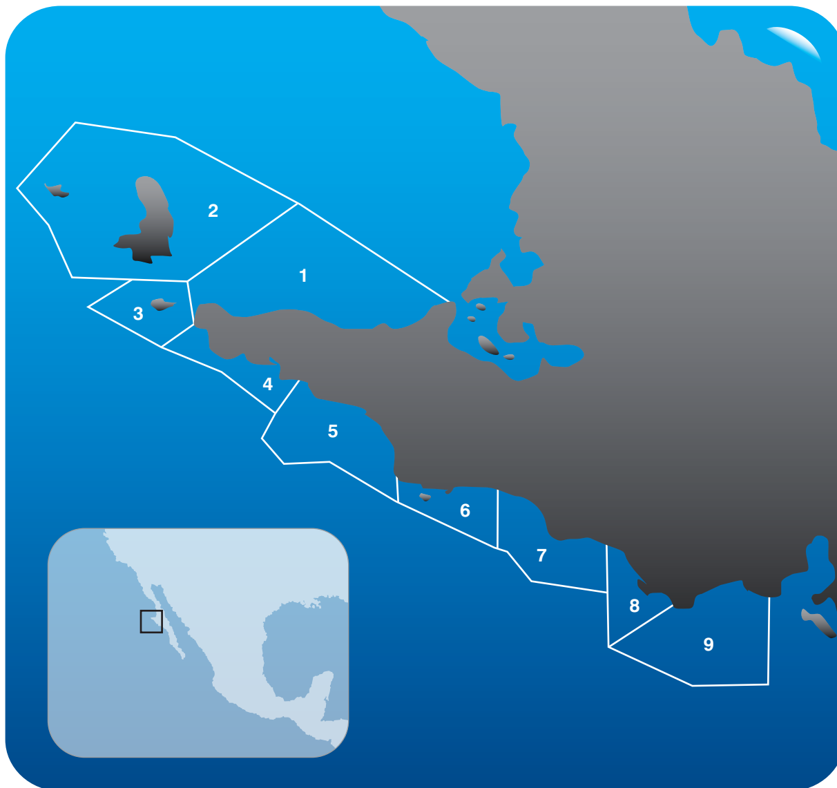
FIGURE 1 | Map of FEDECOOP Concessions and Certified Cooperatives

(1) La Purisima, (2) Pescadores Nacionales del Abulon, (3) Buzos y Pescadores, (4) Bajía Tortugas, (5) Emancipación, (6) California de San Ignacio, (7) Leyes de Reforma, (8) Progreso, (9) Punta Abreojos (Perez-Ramirez, 2012) Note, this map does not show the concession of Puerto Chale, which is located farther south.